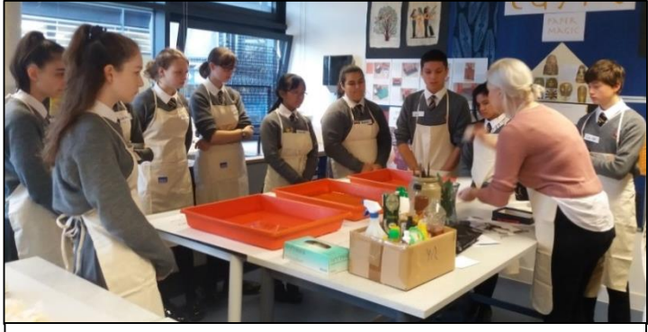
Art workshop at Brighton university