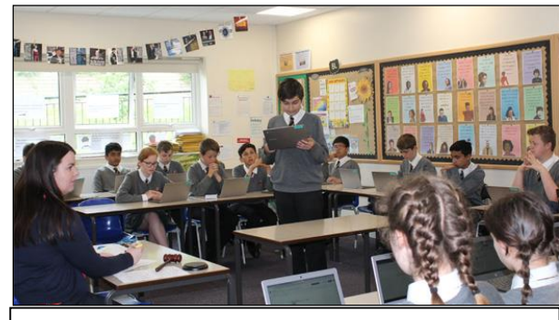
Pupils engaged in English