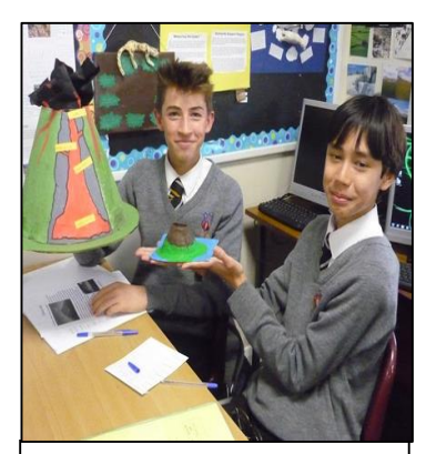
Volcano building in geography