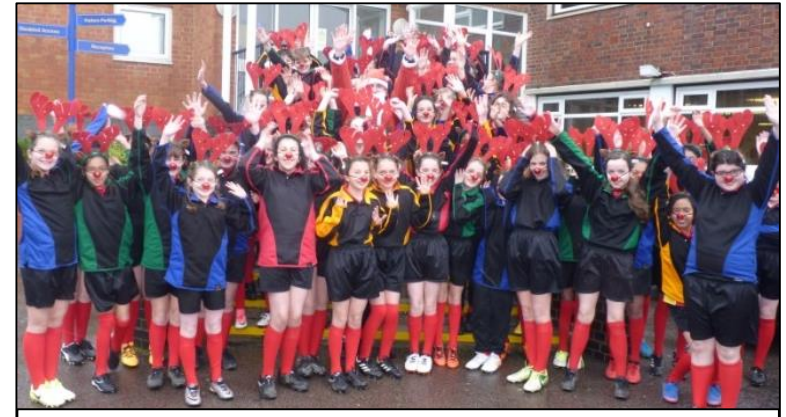
Year 7 Reindeer Run for Charity