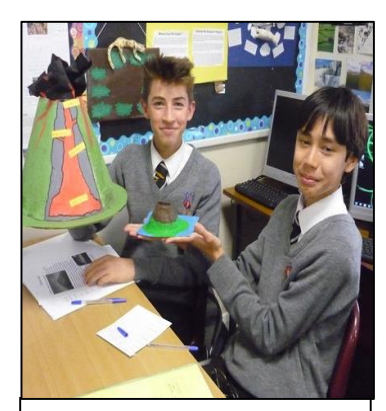
Volcano building in geography